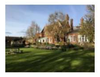
Figure 2: Cosener's House

And here's a picture of The Cosener's House in Abindgdon: