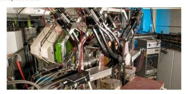
Figure 1: EMU Instrument

This shows how JPEG images can be inserted into an abstract. Here's a picture of EMU: