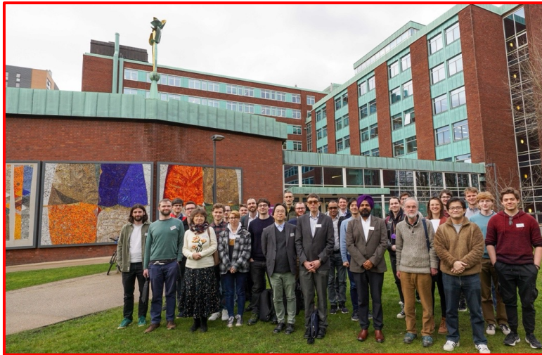
Nuclear Reactions (Manchester)