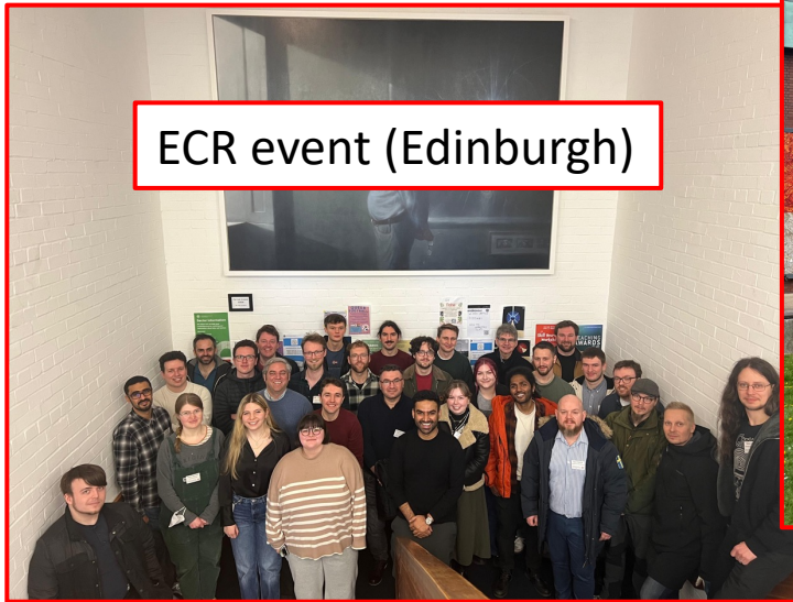
ECR event (Edinburgh)