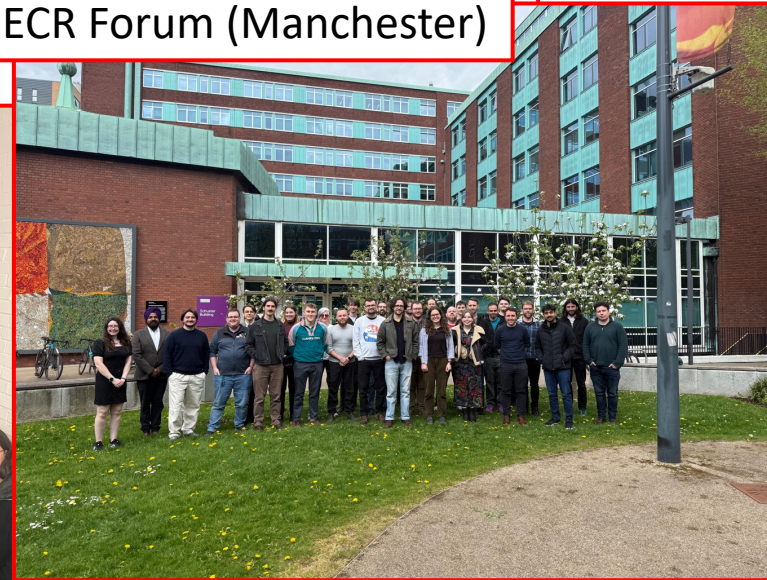
ECR Forum (Manchester)