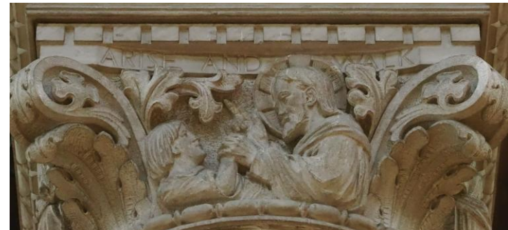
ARISE AND WALK