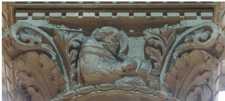
HONOUR A PHYSICIAN